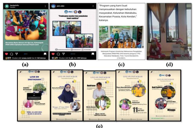
Figure 3. Several flashcards program expansion activities at TPQ Al-Amin : (a) interview by Kendari Info; (b) sharing excitement by PKM Dikti; (c) news articles on the Kendari Info website; (d) expansion

The expansion of the flashcards program is carried out through expansion activities and media publications. The publications of activities that have been carried out are as follows.