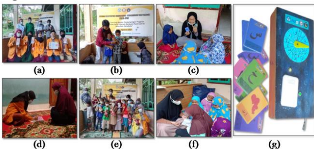
Figure 1. Several flashcards program activities at TPQ Al-Amin : (a) socialization; (b) assistance; (c) teaching; (d) consultation; (e) MONEV (Monitoring and Evaluation), and closing; (f) training of trainers; and (g) audio assisted flashcards.

The flashcards program which was carried out on Lamasa Street, Matabubu Subdistrict, Kendari City, Southeast Sulawesi Province was able to run well according to the targets scheduled in the timeline. The targets of the flashcards program activities carried out on Lamasa Street, Matabubu Subdistrict are: (1) jobdesk distribution; (2) preparation of learning tools; (3) audio-assisted flashcards creation; (4) instrument testing; (5) flashcards game guide book; (6) licensing with related parties; (7) socialization; (8) pre-test; (9) implementation of ATC (Assistance, Teaching, and Consultation); (10) post-test; (11) monitoring and evaluation; and (12) training of trainers. Some of the activities carried out during the program can be seen in Figure 1.